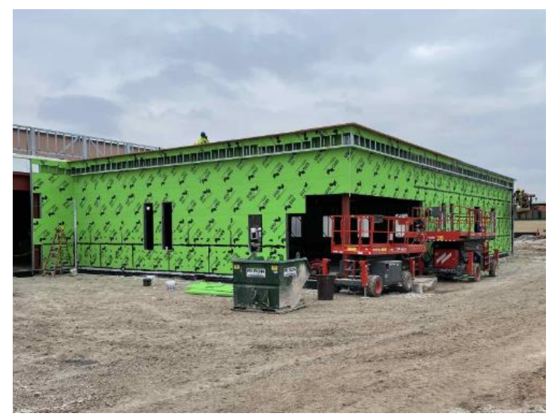
District office exterior wall sheathing is nearly complete.