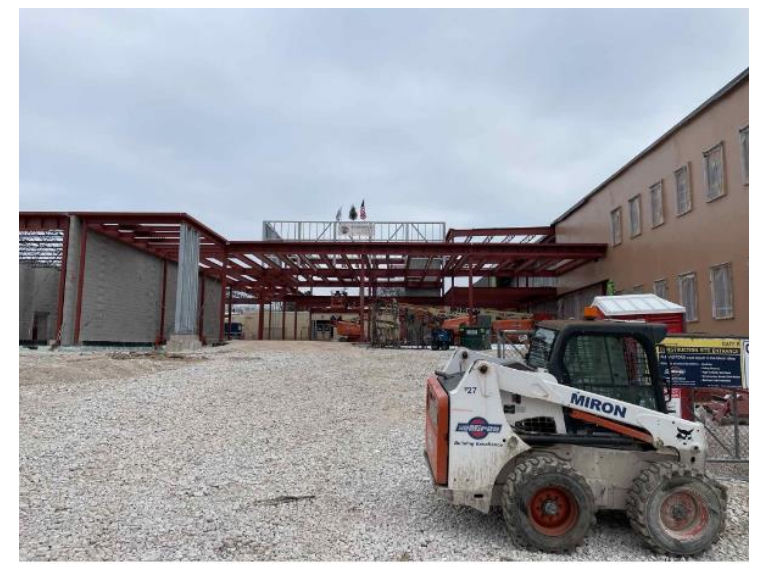
All building mass structural steel framing is complete!