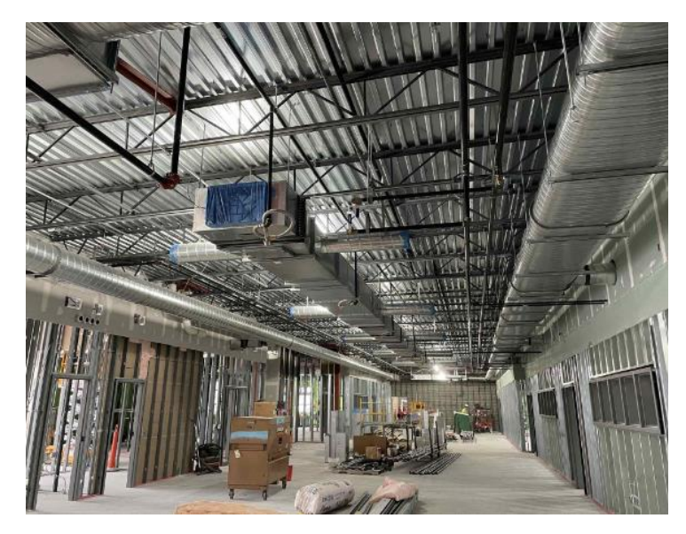
Mechanical ductwork installed in the classroom wing, second floor.