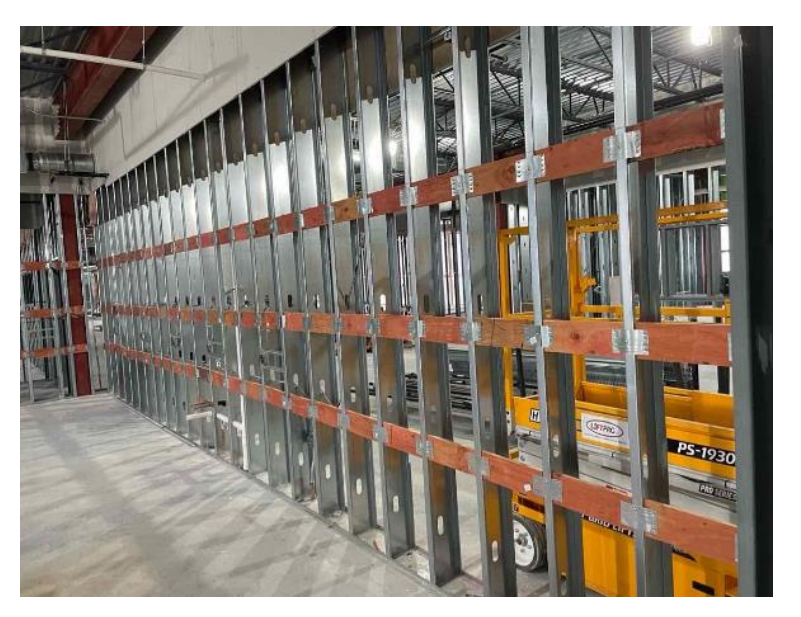
Completed in-wall blocking for supporting new cabinetry in classrooms.